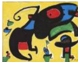
Joan Miró. Personnages et oiseaux dans un paysage nocturne (Figures and Birds in a Nocturnal Landscape), 1978 Oil on canvas Fundació Joan Miró, Barcelona © Successió Miró 2023