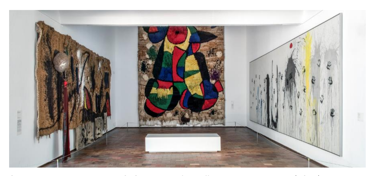
Sobreteixim with eight umbrellas 1973, and Hands flying off toward the constellations (1974), next to the Tapestry of the Fundació Joan Miró, 1979. Presentation before the work on the Tapestry.