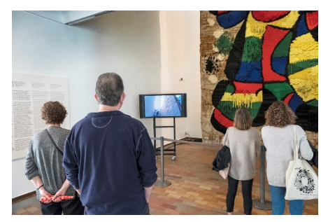
Preventive conservation tasks to the Tapestry of the Foundation. 8–11 March 2019.