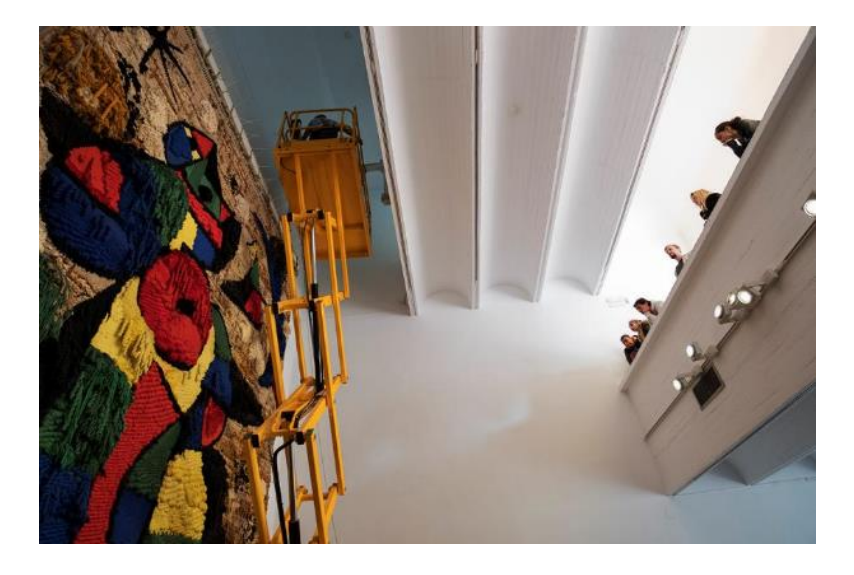
Frontal displacement of the Tapestry. 21 February 2019.