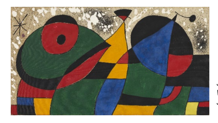
Joan Miró: Model of the Tapestry of the World Trade Center , 1972. Fundació Joan Miró, Barcelona

textiles. Far from being a reproduction in tapestry of his existent works, the artist pursued the idea of finding the textile equivalent to his own language. The technical knowledge of the Tarragona craftsman was decisive, allowing Miró to express himself with the radicality he craved, thus creating one of the most unusual examples of textile art.