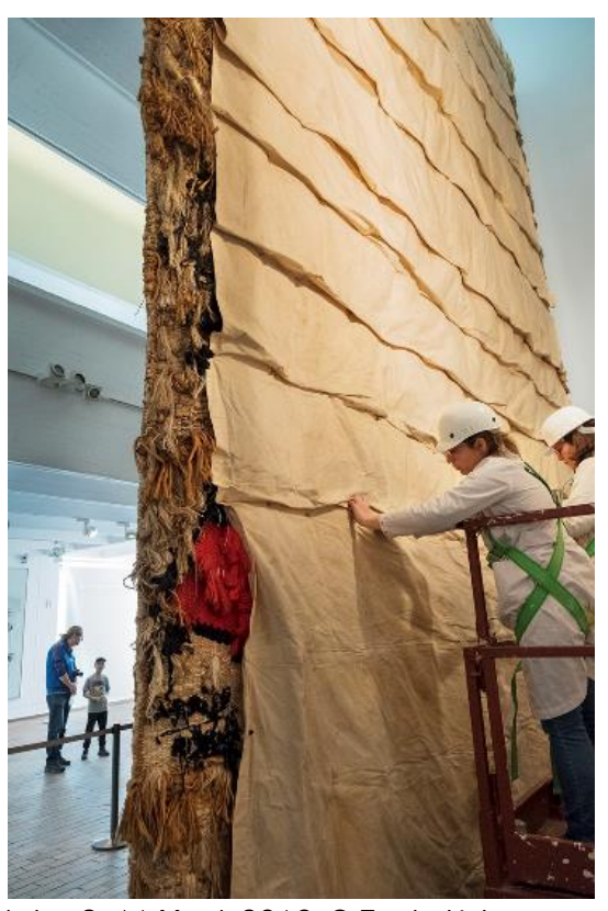
Preventive conservation tasks to the Tapestry of the Foundation. 8–11 March 2019.

This exceptional operation has required a specific project of the Fundació Joan Miró team covering many fields. In terms of patronage, and with the support of Majestic Hotel & Spa Barcelona, in September 2018 the Foundation hosted a philanthropic dinner in the North Patio to raise money for the works.