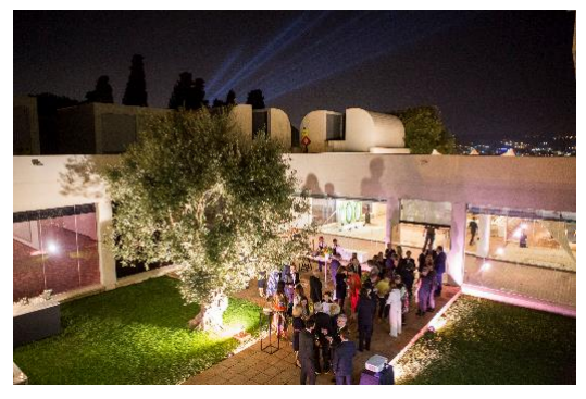
Miró dinner . Fundació Joan Miró and the Majestic Hotel & Spa Barcelona. Philanthropic act in support of the preventive conservation work on the Tapestry . 27 September 2018.